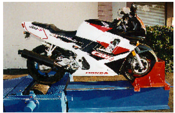
low profile chassis - 1 man loading no need to sink dyno in floor.